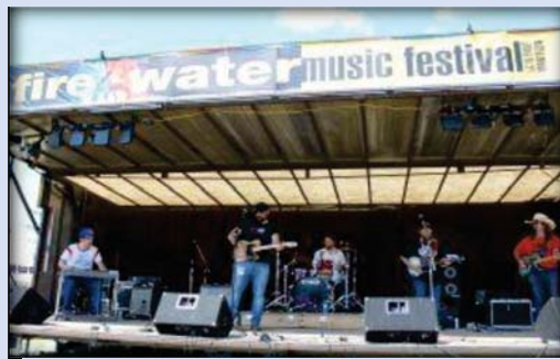
Fire and Water Festival $2,562.00