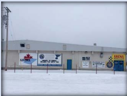
Lac du Bonnet Arena $5000.00

In addition, we were able to facilitate two grants totaling $15,000 through the RBC Future Launch Program described below.