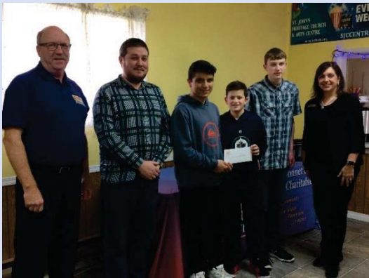
The Lac du Bonnet Youth Centre received $5,750 for their Building Computers project.