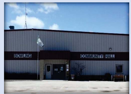
Lac du Bonnet Community Centre $5000.00