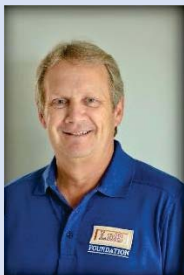
Gary Rollins President