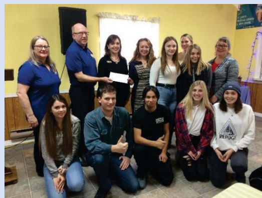
Lac du Bonnet Senior School received $9,250 for their Medicine Wheel Garden project.