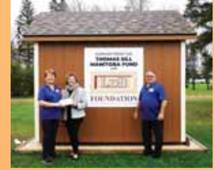
LDB Food Bank

$7,000 towards the purchase of a storage shed and accessories such as shelving, packaging materials and a weigh scale. This was a Thomas Sill Manitoba Fund Grant.