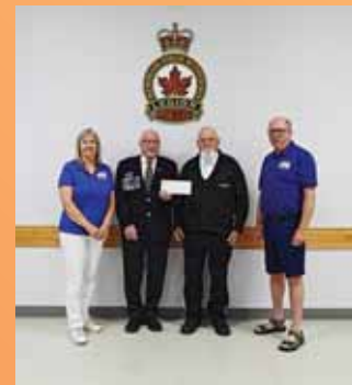
Lac du Bonnet Legion