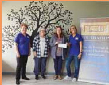
Great Falls & District Recreational Centre