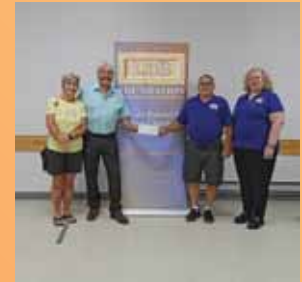
LDB Manitoba Metis Federation

$2,000 towards Phase 1 of the Red River Cart Project.