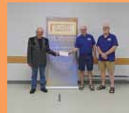
LDB Wildlife Assoc.