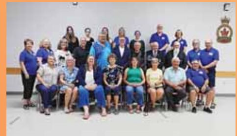
Grant Recipients & Board Members