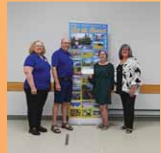
RM of Lac du Bonnet