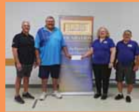
Lee River Snow Riders